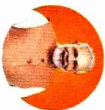
Sri Narendra Modi Prime Minister of India

Building Bridges to Equal Opportunities for PWDs