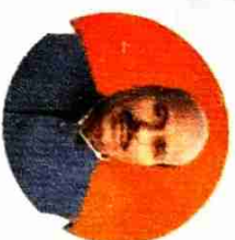
Dr. Virendra Kumar Minister for Social Justice & Empowerment